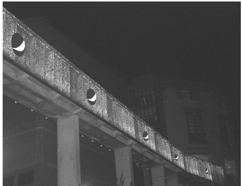
CMU excited to present the newly sponsored Pepsi-Pausch Bridge!//Rock Buddy

The MLM is a revolutionary tactic to overthrow the capitalist ruling class through a novel technique where the proletariat engages in small entrepreneurial schemes. This is the new way to consolidate class awareness and shift power to the working class. Each MLM member must induct a set of other similarly minded people to their ideology by selling them an overpriced starter kit of leggings, makeup, Tupperware, or whatever else, giving them the capital to go forth and recruit others until all the oppressed classes are going around and selling a bunch of useless stuff. Oh and also I forgot to mention by “induct” I mean you have to also have a lot of gay sex or none of it works and the revolution will never happen.